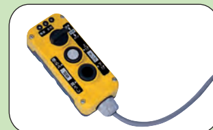
▲ Cable remote controller