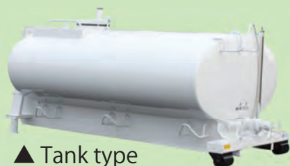
▲ Tank type For water ※JM02 ~ 07model only