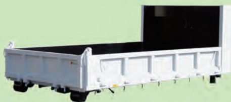
▲ Dump body type For sand and gravel