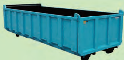
▲ Open top type For refuse and scrap