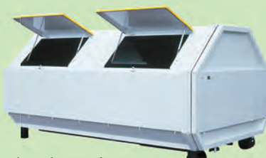
▲ Closed type For refuse of housing complex