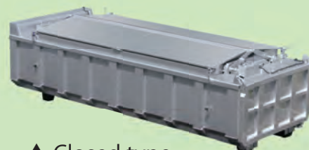
▲ Closed type For refuse