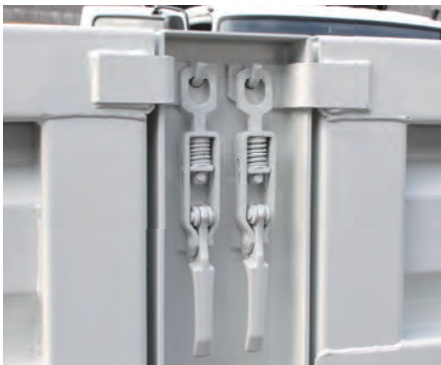
▲ Side gate lock※

※ Side gate lock will be equipped depended on body length.