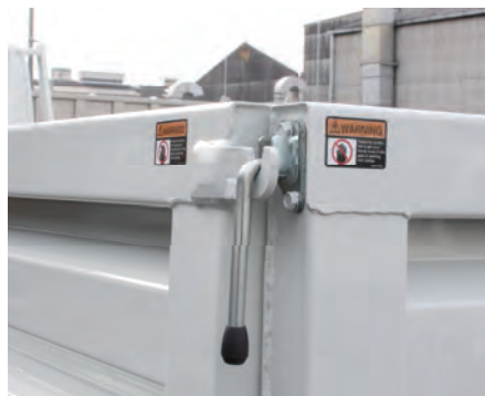
▲ Rear gate lock

※ Side gate lock will be equipped depended on body length.