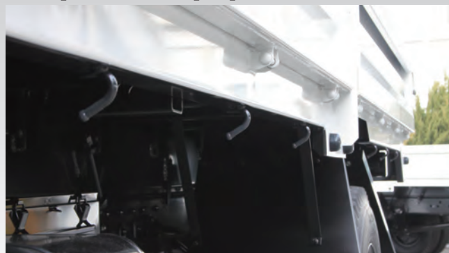
▲ Rope hook

Note : Specifications and the other contents on this catalogue are subject to change without prior notice due to product improvement. Product photos on this catalogue might include optional devices.