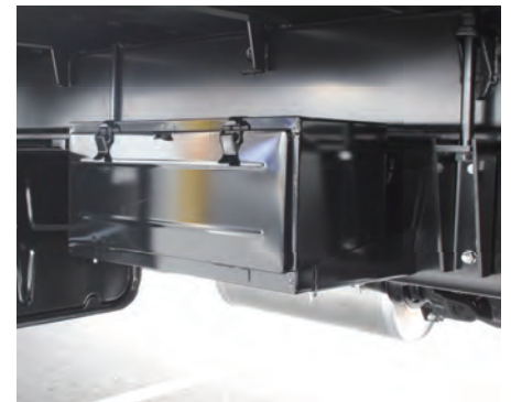
▲ Tool box

The vehicle in the photographs include optional equipments, special coloring and processing.